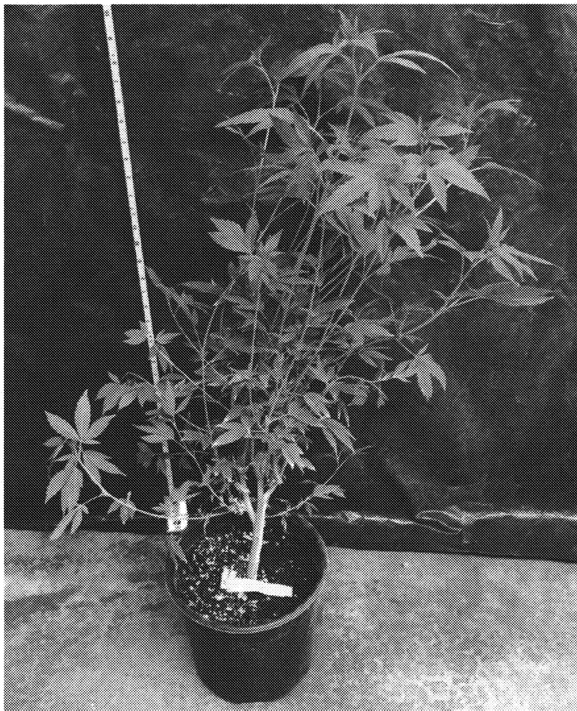
CAKE BATTER COOKIES