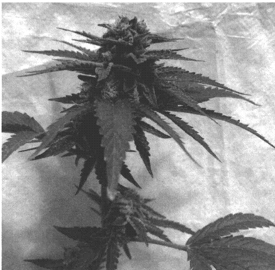
CAKE BATTER COOKIES