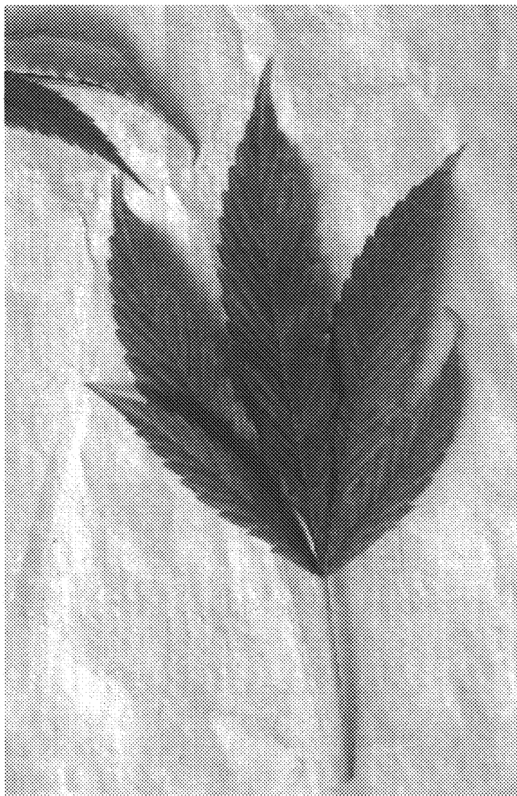
CAKE BATTER COOKIES