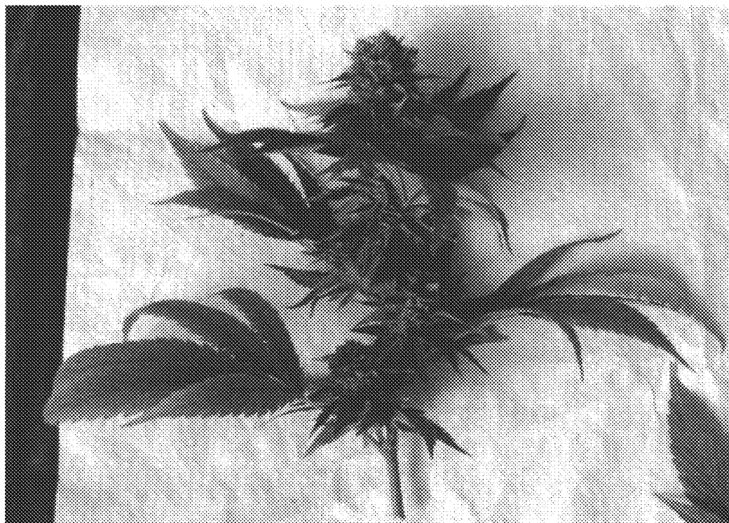
CAKE BATTER COOKIES