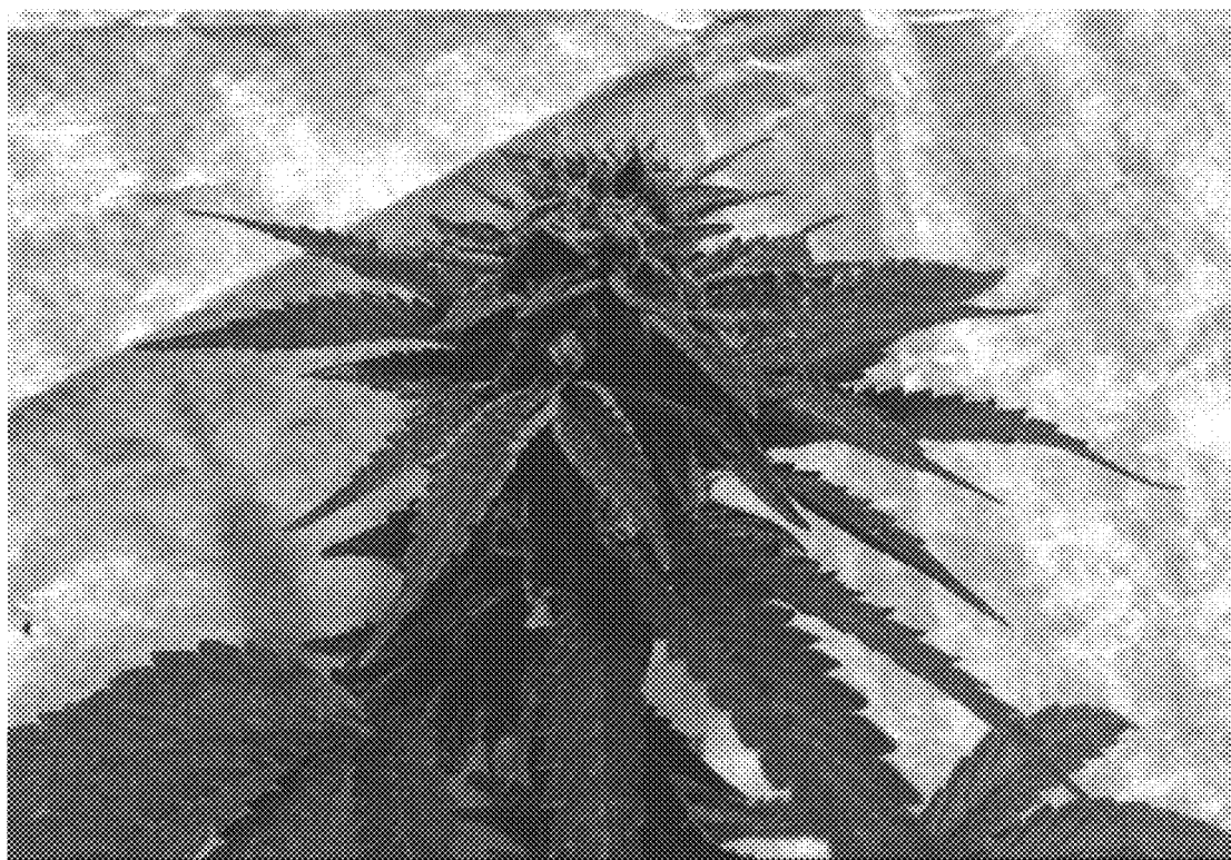
CAKE BATTER COOKIES