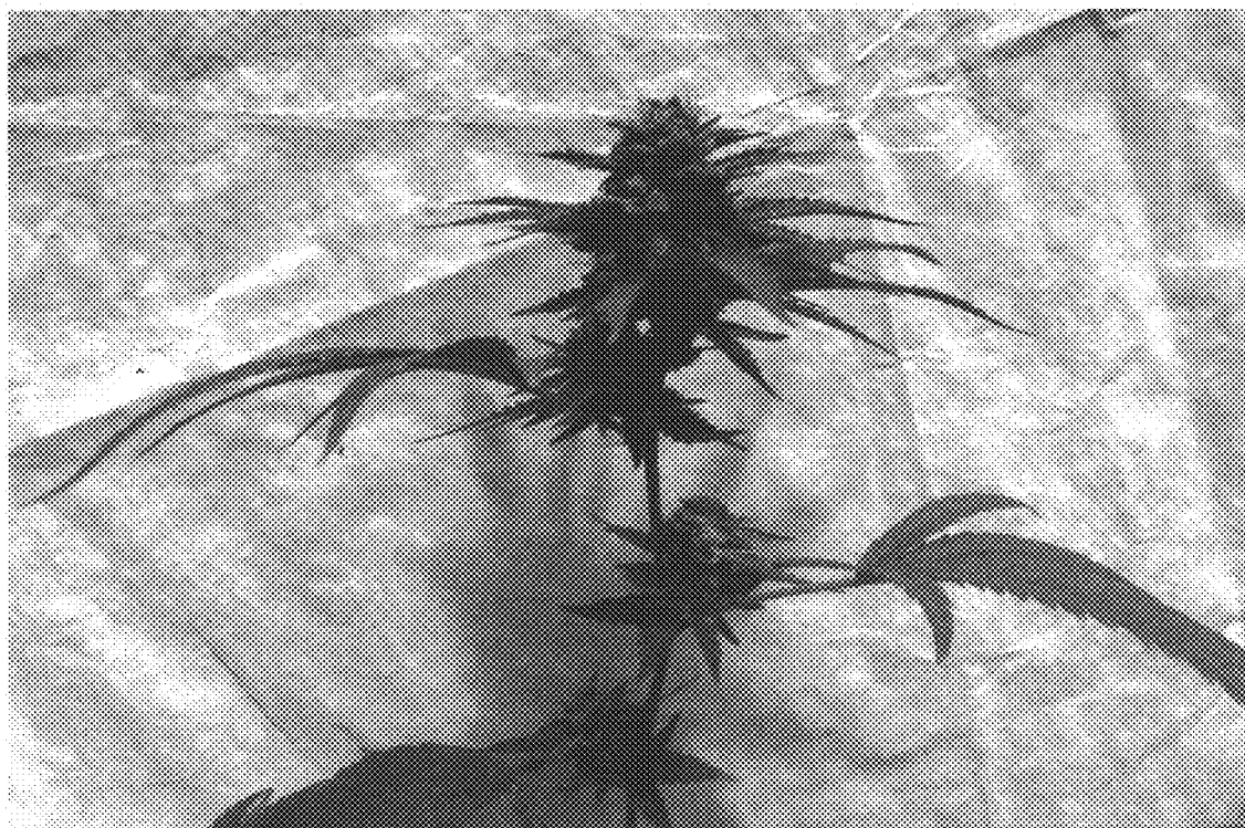
CAKE BATTER COOKIES